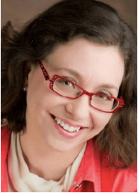
Racheael Cabral Guevara (R-Fox Crossing)